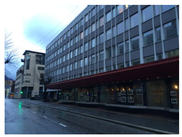
Somewhere inside here, we would be recording...