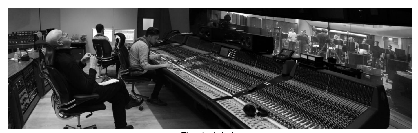
The giant desk.