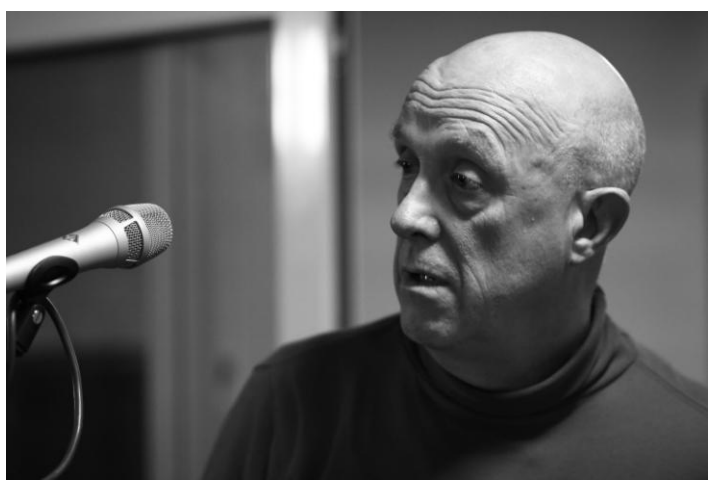
...But he's not sure about this bit...