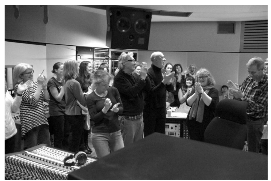
Everyone seemed to have a good time, which is a good omen.