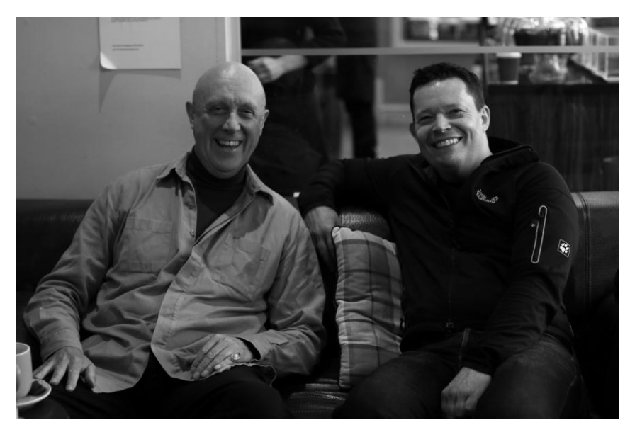
Lunch break in Tooting Bec.