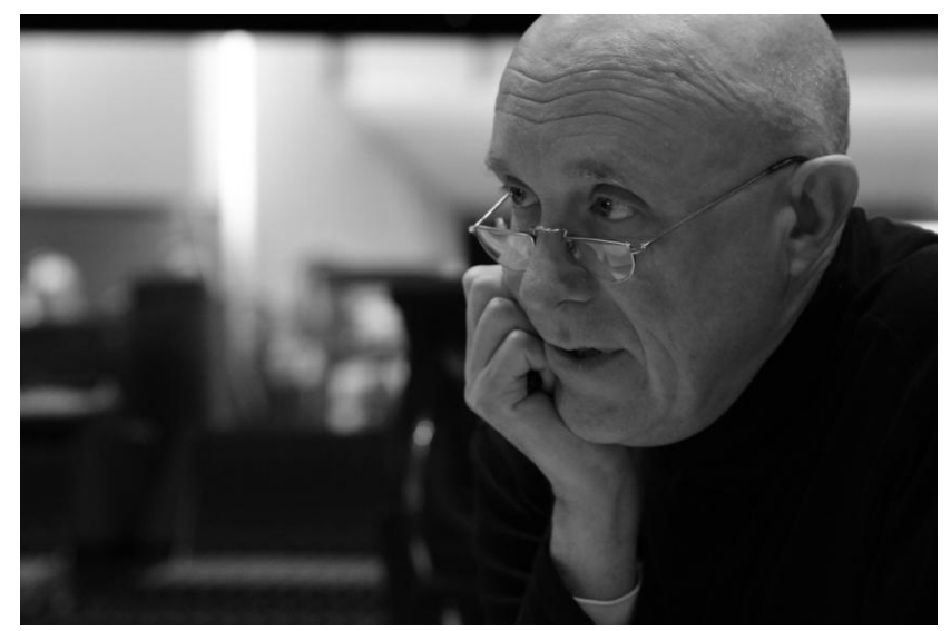
A lot for me to think about.