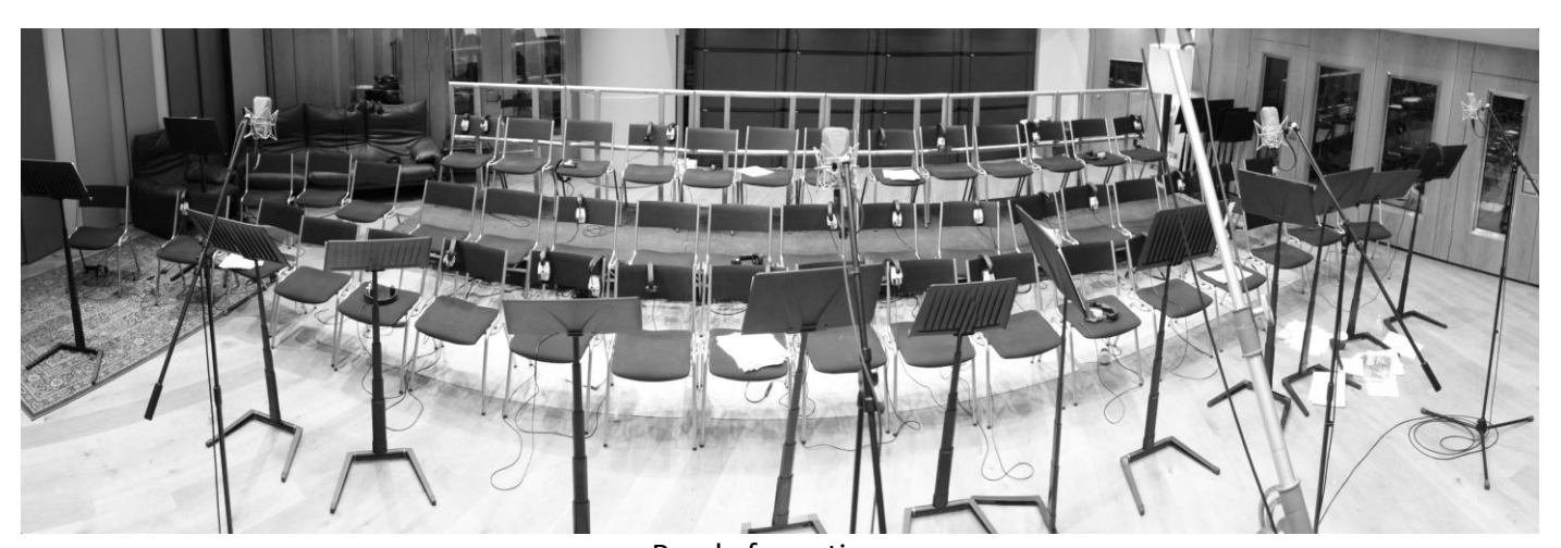
Ready for action...