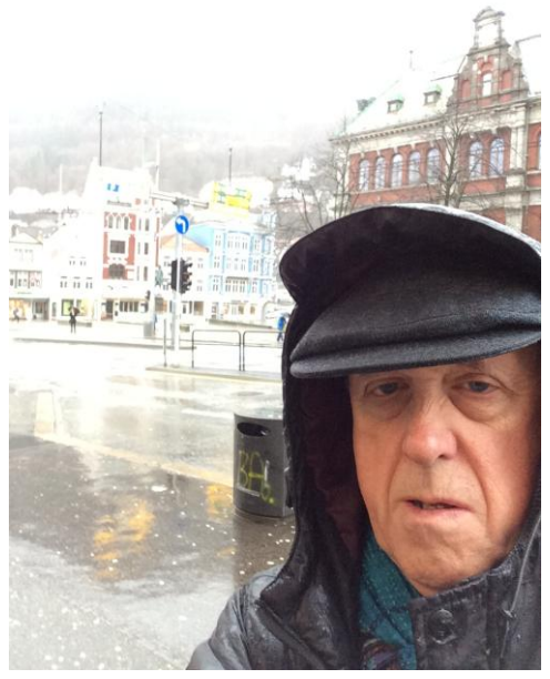
Bergen was very nice, and very wet.