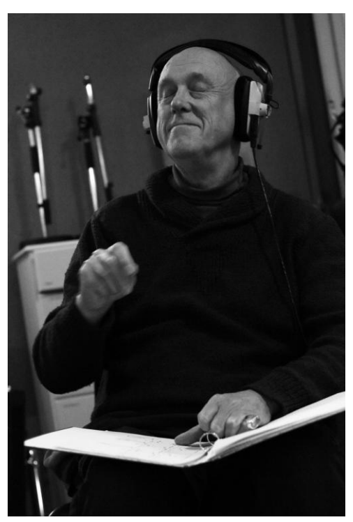
It looks as if it was going well at this point...