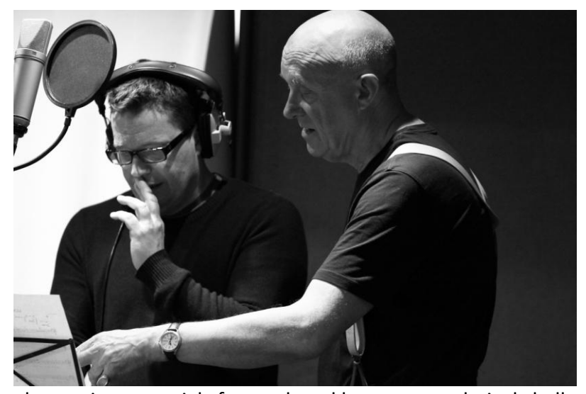
The solo part is not straightforward, and has many technical challenges.