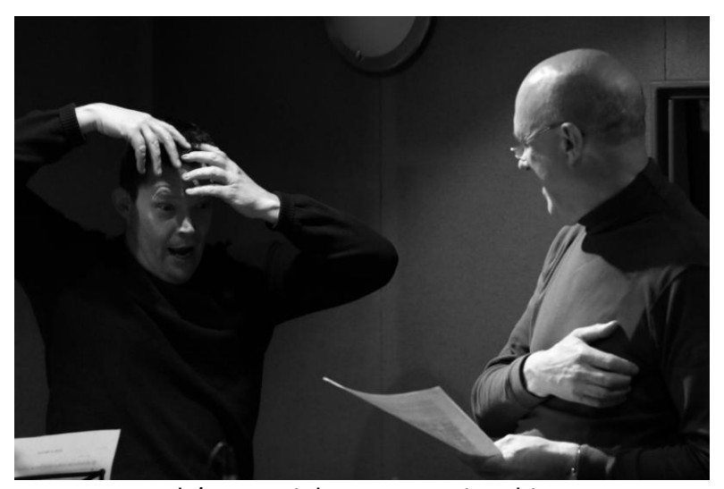
...and I'm certainly not repeating this one.