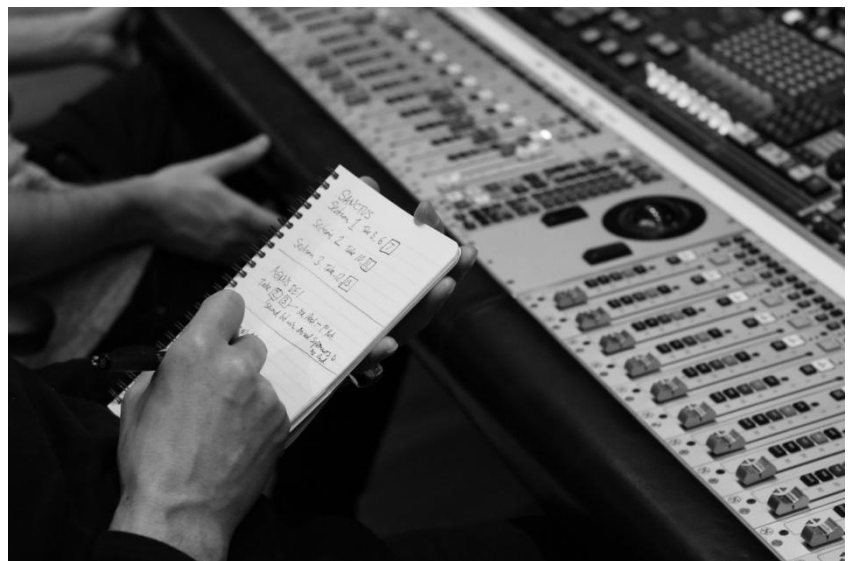
What take to use?