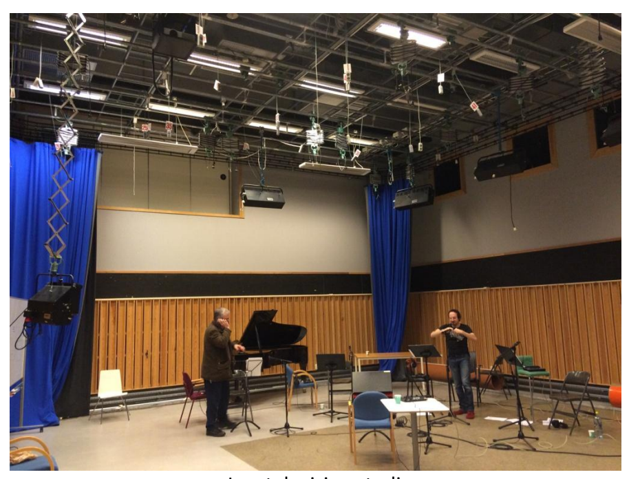
...In a television studio.