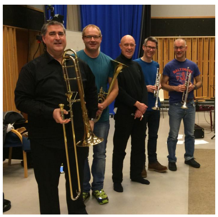
Judge with some Mighty Men of Brass.