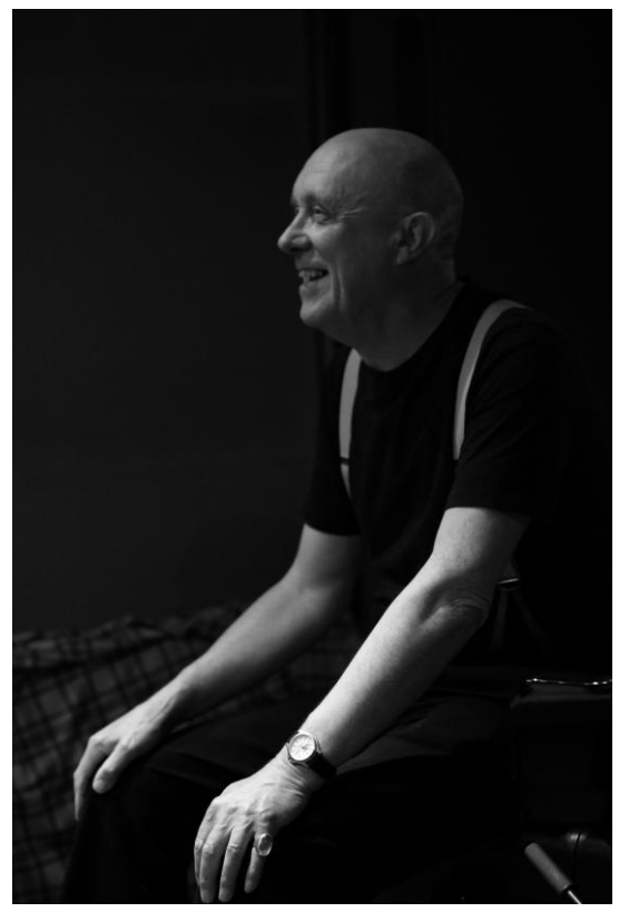
The Composer is pleased.