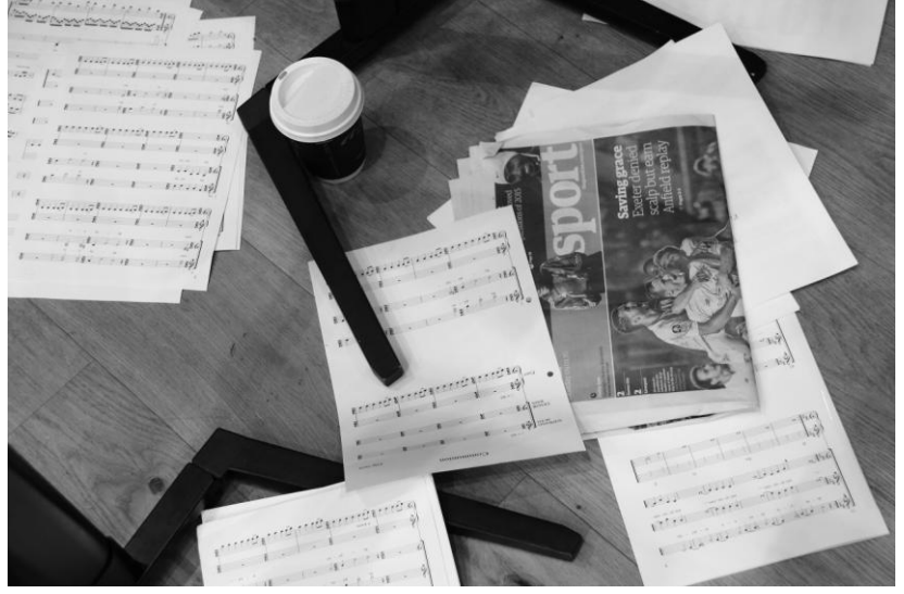
An awful lot of 'dots'.