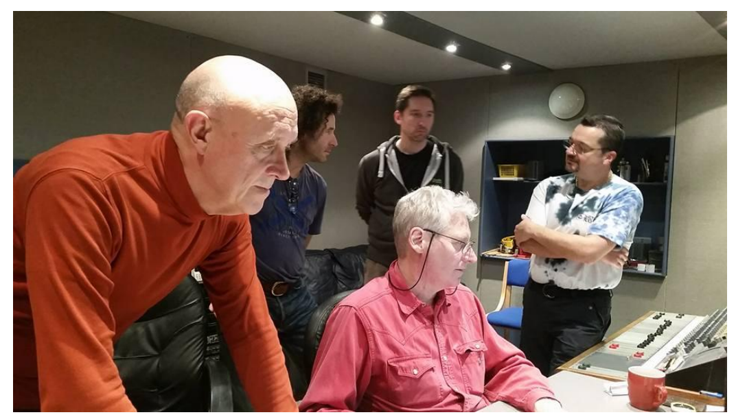
A playback.