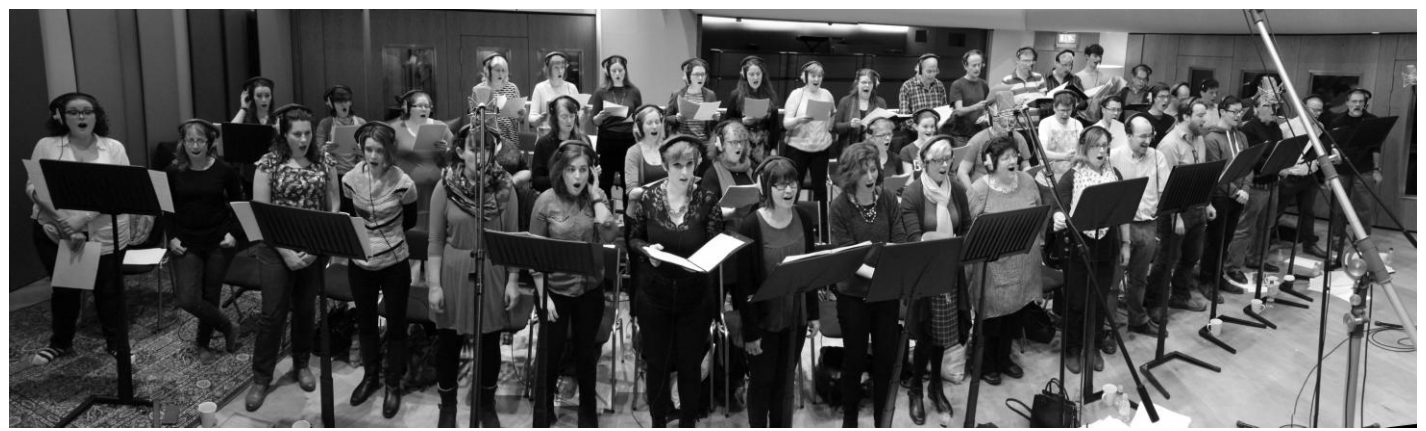
Action stations... The Crouch End Festival Chorus.