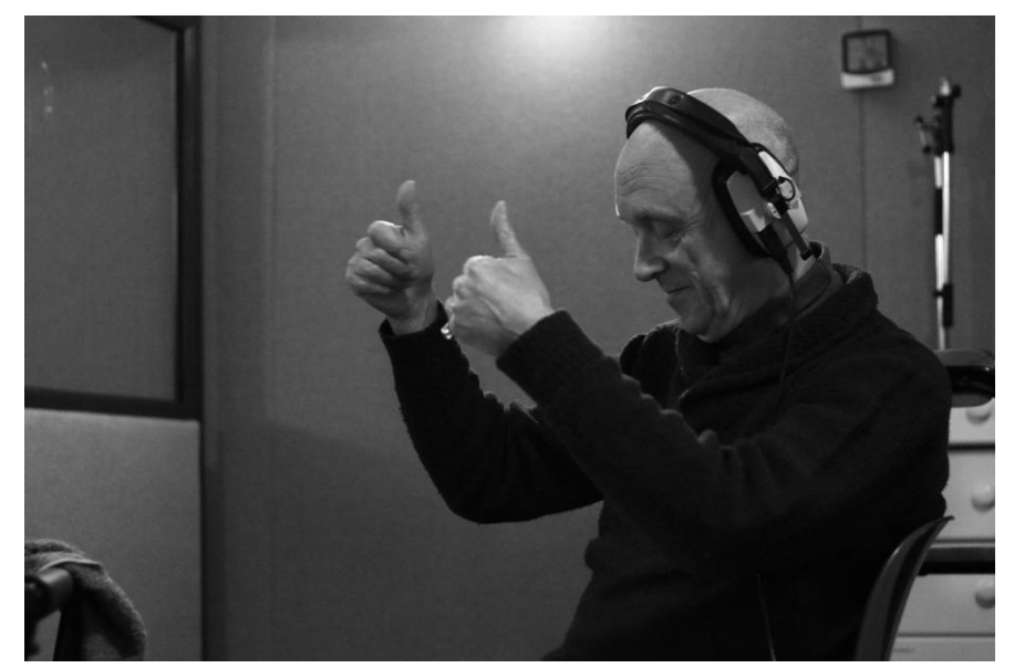
Done and Dusted.