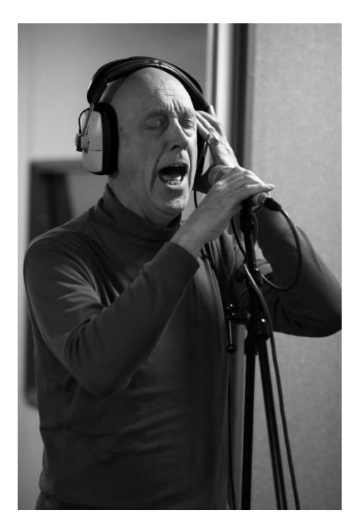
Judge at the mic. (I had to do guide vocals at various points.)